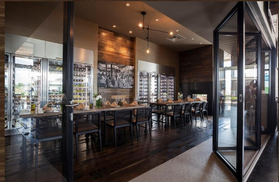
executive room, set as two tables of 8, max seated capacity - 24

private dining requests and questions can be directed to 636.277.0202 ext. 2 or you can email katie brines at katie@prasinostcharles.com .