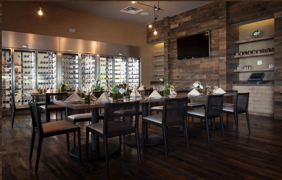
banquet room, set as two tables of 10, max seated capacity - 40

enclosed are specific menu options for breakfast, brunch & lunch